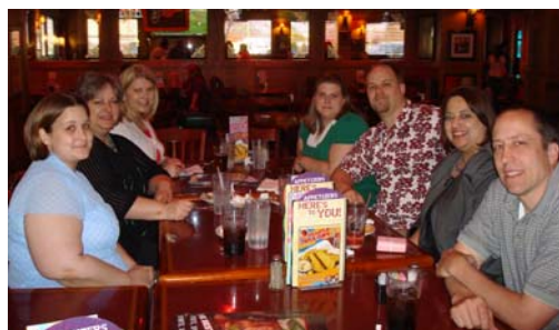
April Social/Networking event