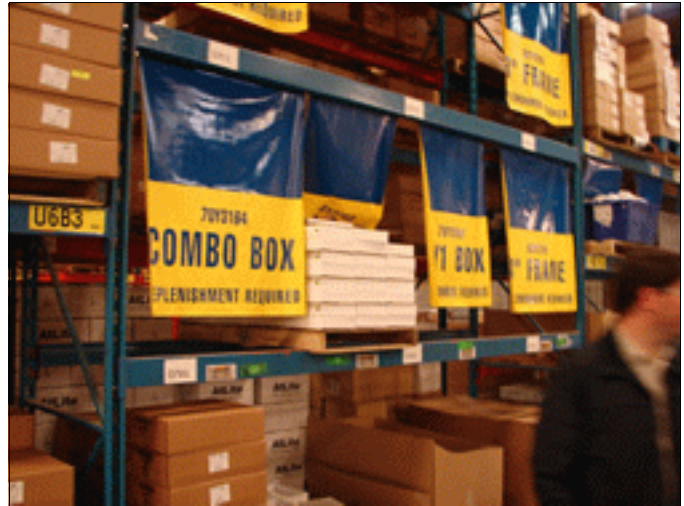
Pallet rack of finished goods with drop-down Kanban banner

Delivery - Cost goals, hour by hour charting of production against standard, posted corrective actions for missed goals, posting of improvement ideas, 5S / Housekeeping scoring. Each of the work cells is designated by a color (ex.: The Red Cell, The Blue Cell, etc.), which helps to signify what belongs to a particular cell. (Ex.: Tools that are dedicated to a cell are painted in the cell color).